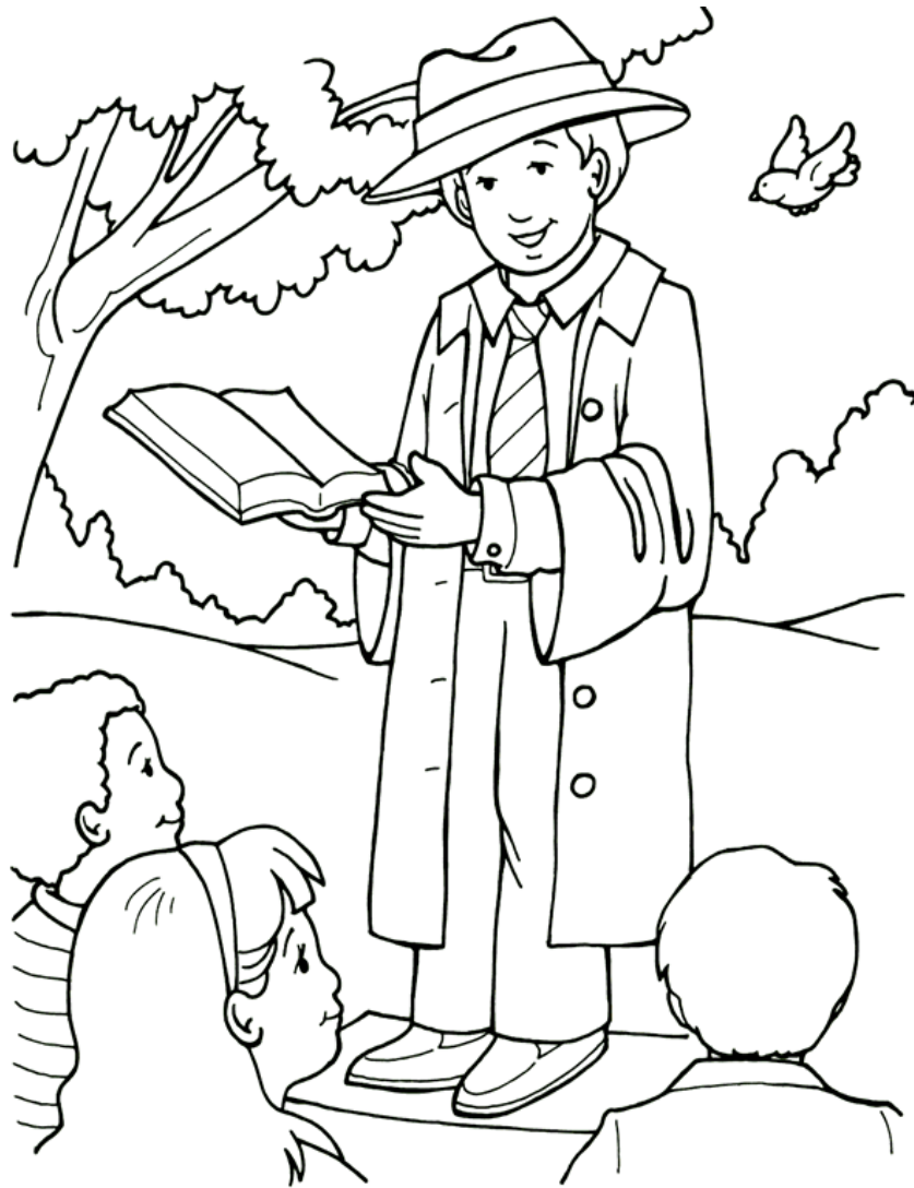
Inviting others to Jesus.

Each number represents a letter of the alphabet. Substitute the correct letter for the numbers to reveal the coded words.